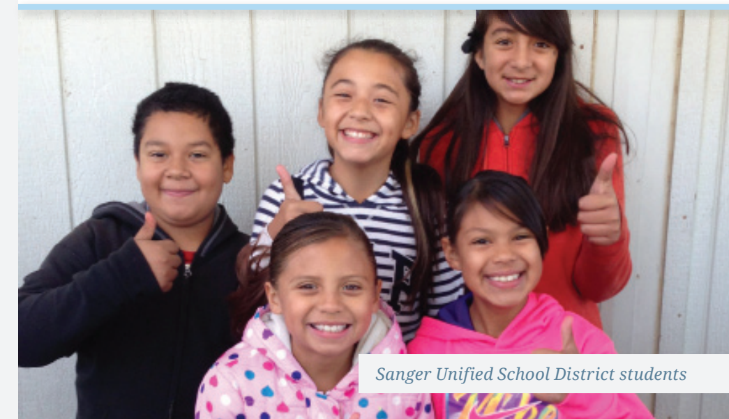
Sanger Unified School District students

From 2005 to 2012, student scores on the California Academic Performance Index (API) increased from 702 to 822. For EL students, the scores increased from 636 to 772.